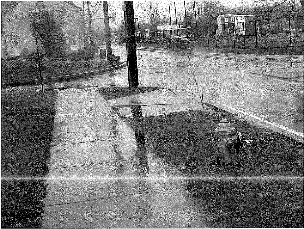
B. Montgomery Ave (SR 2009) & Lincoln Ave (SR 2007) – West Ramp