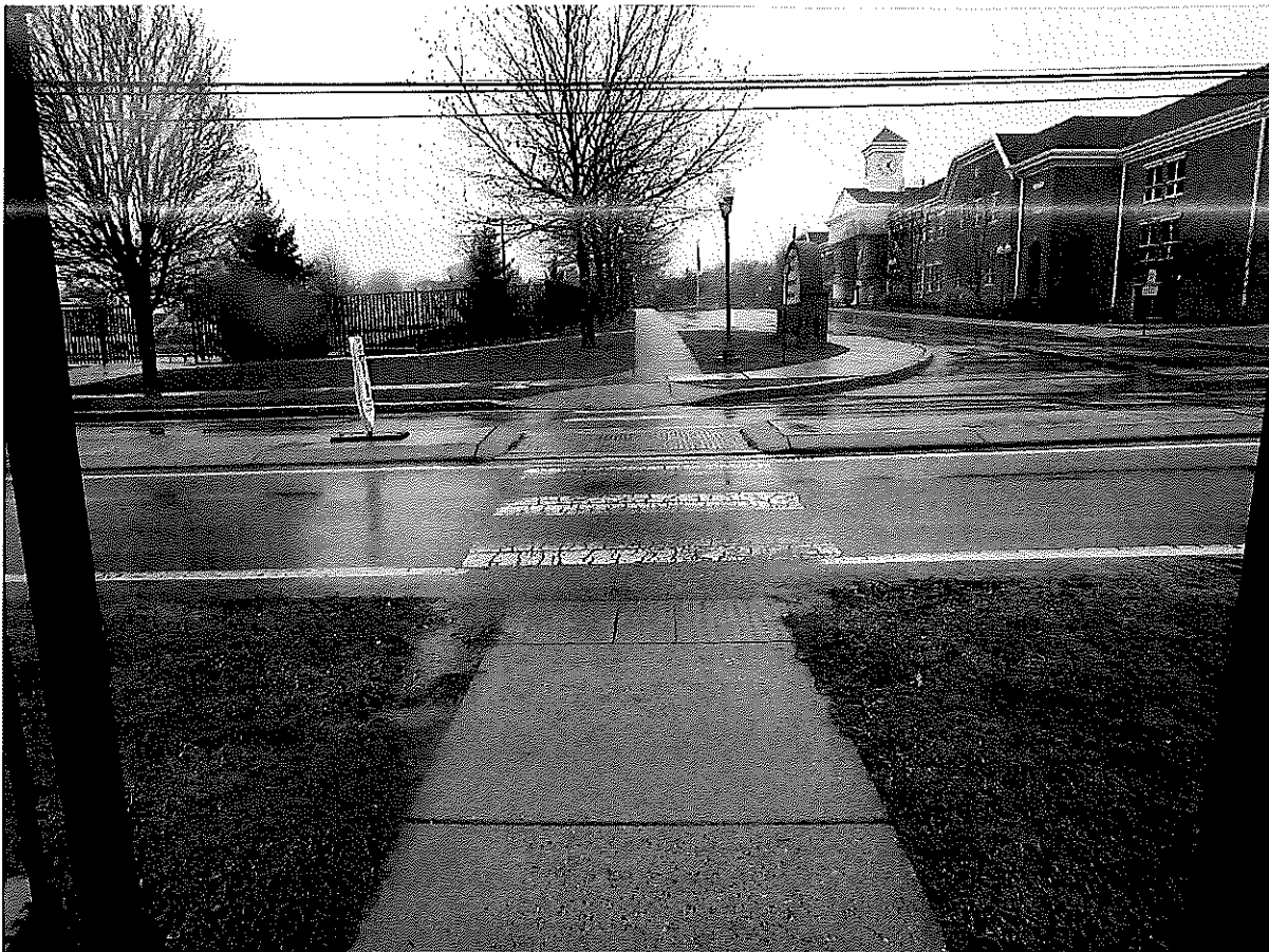
A. Montgomery Ave (SR 2009) & Henderson Highschool Driveway – Pedestrian Crossing