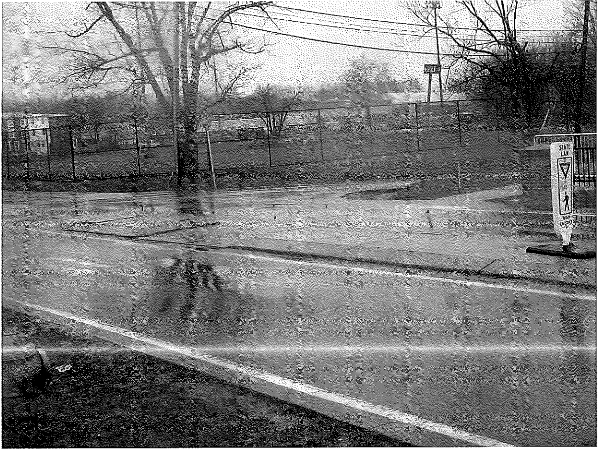
A. Montgomery Ave (SR 2009) & Lincoln Ave (SR 2007) – Pedestrian Crossing