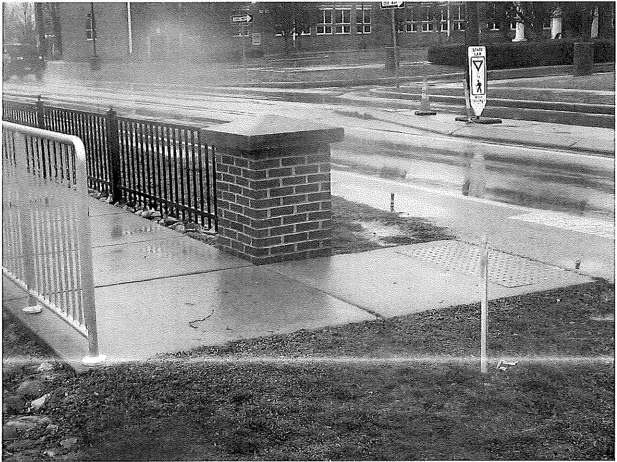
C. Montgomery Ave (SR 2009) & Lincoln Ave (SR 2007) – East Ramp