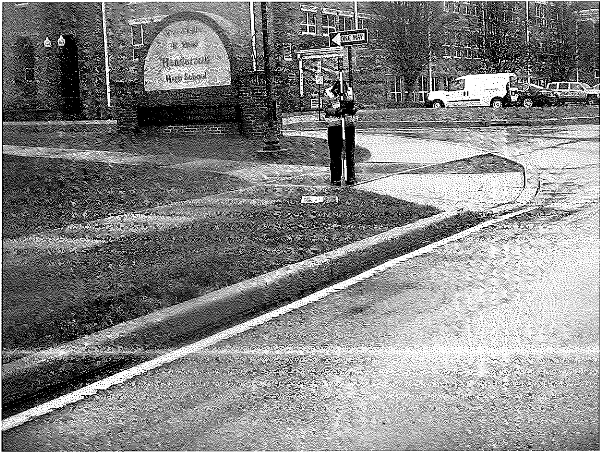
B. Montgomery Ave (SR 2009) & Henderson Highschool Driveway – West Ramp