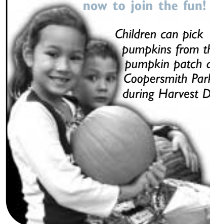
Children can pick pumpkins from the pumpkin patch at Coopersmith Park during Harvest Day.

Harvest Day is FREE OF CHARGE and is limited to residents of West Goshen Township. Preregister at www.westgoshen.org . Guests are encouraged to bring a donation for Chester County Cares in the form of soap, diapers, toilet paper, laundry detergent, toothpaste, or shampoo. Harvest Day is a rain or shine event. Plan now to join the fun! ★