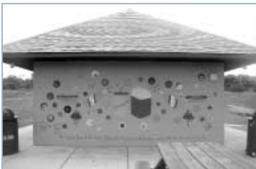
Participants in the West Goshen Teen Program painted a mural on the concession stand at Community Park.