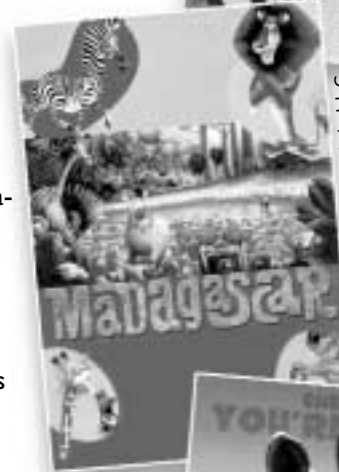
Madagascar: TM & © DreamWorks L.L.C.