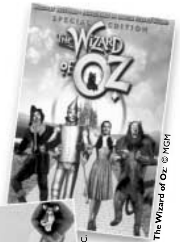
The Wizard of Oz

The J. Leon Hagerty Amphitheater is located in West Goshen Community Park at N. Five Points and Fern Hill Roads. In the event of inclement weather, the performance would be postponed to Sunday, August 14, 2005 at 6:00 PM. Guests are encouraged to bring a dry good donation (soap, toilet paper, diapers, deodorant, shampoo, laundry detergent, etc.) for Chester County Cares. For rain determination or more information, visit www.westgoshen.org .