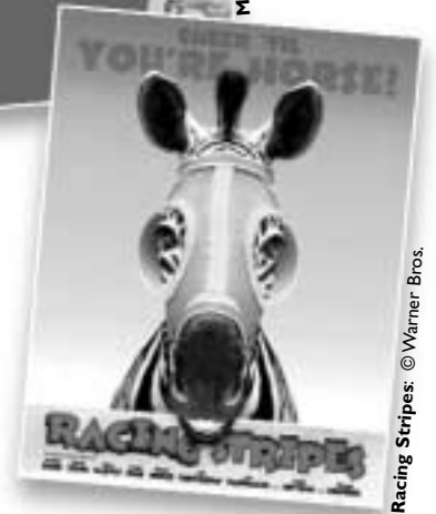
Racing Stripes: © Warner Bros.