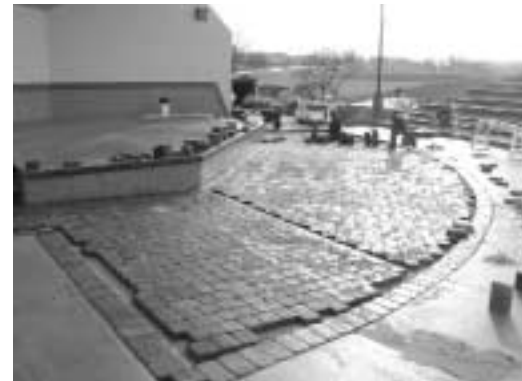
Members of The West Goshen Parks Crew laying pavers at the J. Leon Hagerty Amphitheater.