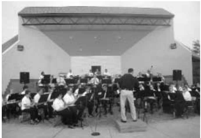
The Chester County Concert Band performing at West Goshen Community Park on June 26, 2005.