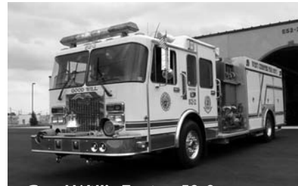
Good Will's Engine 52-2

The Neptune Fire Company formed in 1833. In 1837, Neptune would change its name to Good Will after purchasing an engine from the Good Will Fire Company of Philadelphia.