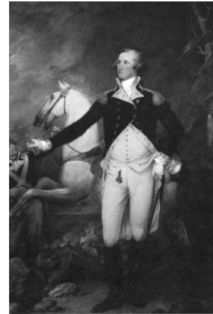
George Washington was one of participants in The Battle of the Clouds which took place in Chester County

The Committee meets at the Community Room of the West Goshen Township Administrative Building on the fourth Thursday of each month at 7:00 PM. The Committee is looking to increase membership, and encourages