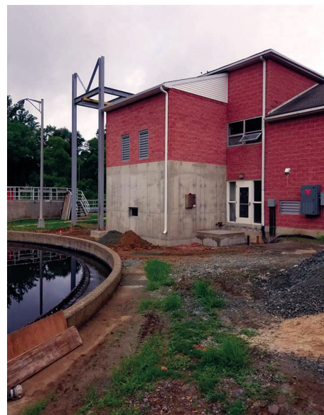
Headworks after improvements

functional aerated grit removal system with a new vortex style system. Also included was the replacement of a worn and deteriorated mechanical fine screen. The screen was replaced with two, smaller units for added redundancy. A portable docking station was added to allow for a towed generator unit to be utilized in case of