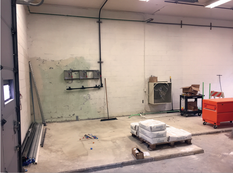
Prior to installation of pH Adjustment System

planned or emergency power loss to the building. The project also included upgrades to the building's ventilation system and the relocation of non-hazardous rated electrical equipment from within the hazardous rated area in accordance with the National Fire Protection Association (NFPA) 820 standards. This project was important as the headworks facility protects downstream equipment and processes by removing rags, grit, and other debris from the influent wastewater.