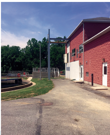
Headworks before improvements

Headworks – The headworks improvement project consisted of replacement of an existing non-