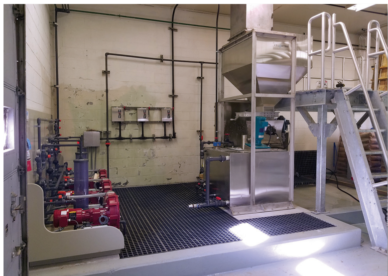
After installation of pH Adjustment System

Lift Stations – West Goshen currently has ten Lift (or pump) stations, four of which are planned for improvement. Upgrades will be based on various needs relating to NFPA 820 code compliance, equipment deterioration or underperformance, and personnel safety. All lift stations, including those not scheduled for improvement, will have bypass pump connections installed to allow for connection of a temporary, external pump should there be a major malfunction within a station. The bypass connections will also be used to safely isolate a lift station for planned maintenance, repair, or upgrade.