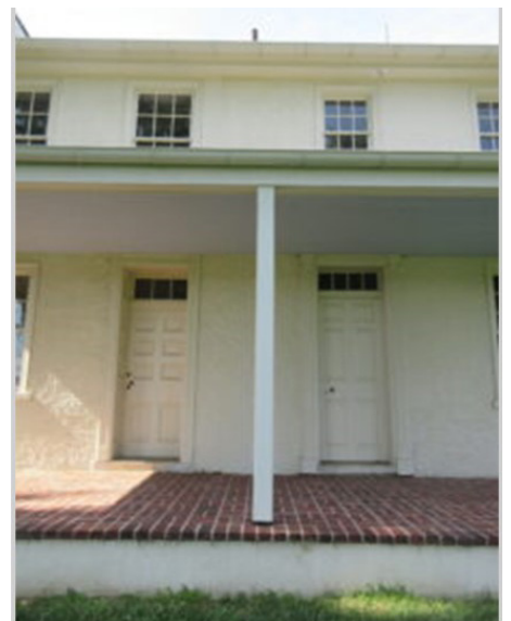
Matlack House Front Center