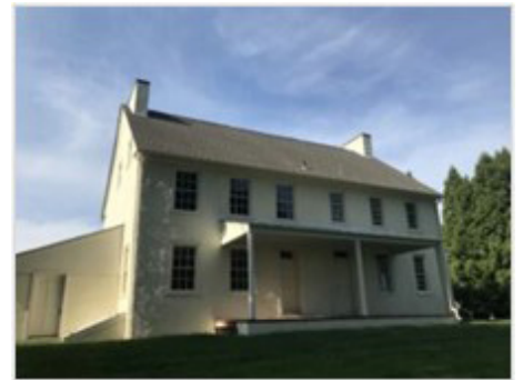
Matlack House Front

Watching the preservation of this historic structure within West Goshen Township gives hope that more of our local history will be preserved. Although it may appear that our township includes extensive twenty and twenty-first century construction, we are still surrounded by history. As you travel around the township, make sure to look out for other historic properties.