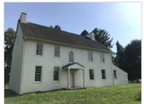
Matlack House Back